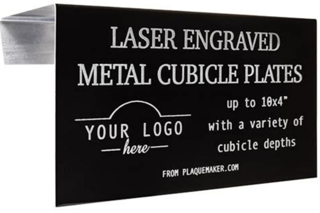
Diy office cubicles. Funny names for cubicles. Cubicle name plate ideas.